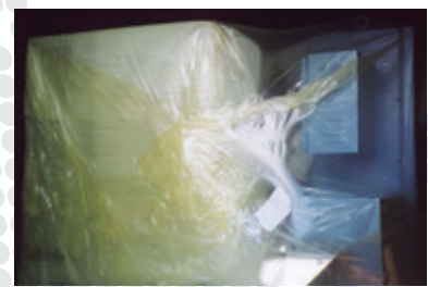
Equipment is protected externally by Zerust film and internally the electronics are protected by Zerust Vapor Capsules.

Zerust VCI Film and Vapor Capsules completely controlled corrosion and reduced costs by 57% over desiccant-barrier packaging methods.