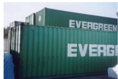
Five ISO 40' containers loaded with conveyors, controllers and other factory equipment were protected by Zerust for over 1-year.

Zerust helped them implement a protection system for five 40' cargo containers, fully loaded with conveyors, controllers and other factory equipment, that were to be shipped from the East Coast to the Middle East. The machinery was wrapped in Zerust ICT510-C Ferrous Film, then heat-sealed and heat-shrunk to provide a tight enclosure. Additional multimetal corrosion protection was provided to the inside of each piece of equipment by Zerust VC6-1 Vapor Capsules. Before shipping they were stored crated outside for over one year awaiting to be loaded. The Zerust system was very effective; all machines arrived at their final destination free of corrosion. Comparing Zerust to the desiccant-barrier packaging method, the company found that Zerust packaging was more effective and reduced costs by 57%.