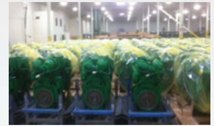
Zerust VCI Bags with ActivPak VCI Diffusers

Applied Zerust VCI Bags and ActivPak VCI Diffusers to protect 2,000 engines for over 5 years without rust