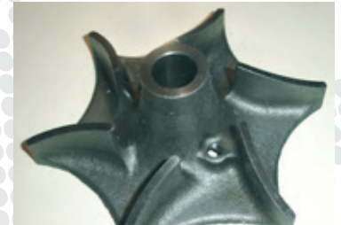
The same part after treatment with Zerust ICT620-RR Rust Remover.