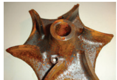
A severely rusted cast iron impeller.

Zerust ICT620-RR quickly and easily recovered rusty parts—saving time, money and satisfying customers.