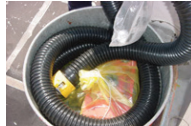
Zerust VCI bags protected bail-out pumps from corrosion until they are needed.

They needed a solution that would help mission critical equipment stay operational and reliable. At the recommendation of Zerust, the organization decided to use Zerust Vapor Capsules and Zerust ICT510-C Ferrous VCI Bags and Sheeting to protect their aids to navigation, bail-out pump motors and small engines for a six month trial period. The tests were extremely successful! No new corrosion was found on any of the equipment. Zerust products proved to be an effective solution against corrosion by improving boat operational readiness, equipment reliability and saving critical resources such as time, manpower and money.