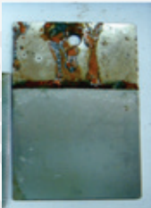
Protected by Zerust VCI Tape for 48 hours