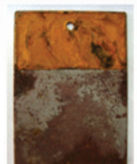
Protected by plain tape for 96 hours

Warranty and Disclaimer Information: We guarantee our products conform to documented quality specifications. Product information subject to change without notice. We make no warranty of any kind expressed or implied as to the effects of use (including, but not limited to, damage or injury). For full warranty and disclaimer information visit, www.zerust.com/warranty .