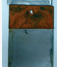
Protected by Zerust VCI Tape for 96 hours