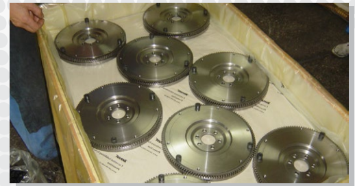
Zerust ICT510-CLHD High-strength VCI Film