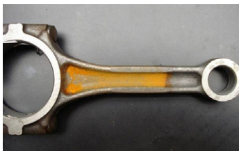
ZERUST® AxxaClean™ Rust Removers