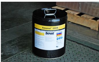
ZERUST® Rust Preventative Coatings and Additives