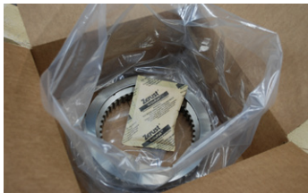
ZERUST® ActivPak® Diffusers