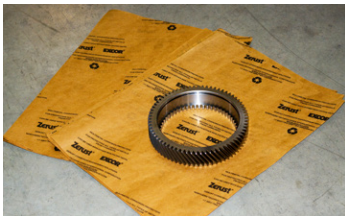
ZERUST® VCI Kraft Paper Sheets