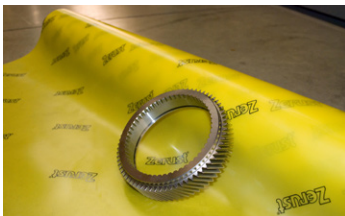
ZERUST® VCI Poly Film and Bags