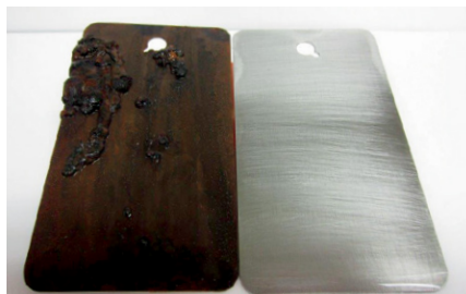
On the left: submerged in untreated water (60 ppm Cl - , 300 ppm CaCO 3 ), on the right: submerged in AxxaVis™ HST-10 treated water.

Axxatec™ 8110C is a water-based additive for the protection of water-filled void spaces of hydraulic and coolant equipment.