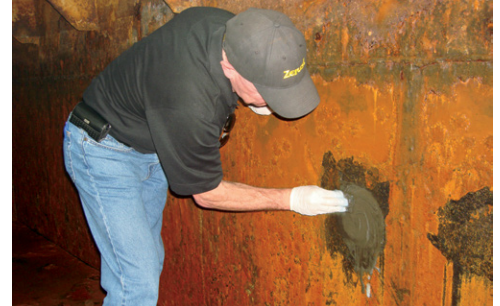
ZERUST® corrosion engineer in the field demonstrating a rust remover

For over 50 years, beginning with the invention of VCI film packaging, ZERUST®/EXCOR® has led the market in quality corrosion solution products. We are dedicated to providing expert corrosion management services and broadening the range of corrosion solutions for our customers. In addition, ZERUST® users have access to onsite support from ZERUST®/EXCOR® representatives in more than 70 countries. As a result, our customers have peace of mind when they choose ZERUST® for corrosion control management.