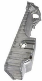
Aluminum drip pan

The aluminum drip pan supplier has been using the solution provided by Zerust® and HARITA-NTI for several years, without any issues of corrosion.