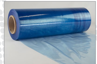
Zerust® ICT® 510-SM Stretch Film

Zerust® corrosion experts recommended a packaging solution to protect aluminum coils from corrosion—enabling the supplier to fulfill their customers requirements.