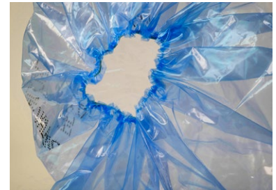
Zerust® Custom Coil Cover

The aluminum rolling mill have been using the solutions provide by Zerust® for several years and have been very pleased with the performance of the Zerust® products.