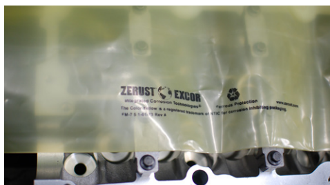
ICT®510-PCR30 VCI Sheeting

ICT®510-PCR30 VCI Film is a proven ZERUST® Vapor Corrosion Inhibiting (VCI) film with 30% post-consumer recycled (PCR) polyethylene, providing sustainable and versatile protection against corrosion damage for metals in shipping and storage. Post-consumer recycling is a process that revolves around the collection, processing (sorting, washing, grinding, extruding), and reuse of materials and products that have been used by consumers and then discarded. This approach is vital for reducing waste, conserving resources, and mitigating the environmental impact of traditional disposal methods like landfills and incineration. Use ZERUST® ICT®510-PCR30 VCI Film to protect metal components and assemblies, machined and cast parts, and more for years † . For additional protection in challenging environments, ZERUST® VCI Film may be used with ZERUST® corrosion inhibitor liquid RPs and VCI diffuser products. ICT®510-PCR30 VCI Film can be made into VCI bags, gusset liners, tote covers, and more for the ideal protective packaging solution.