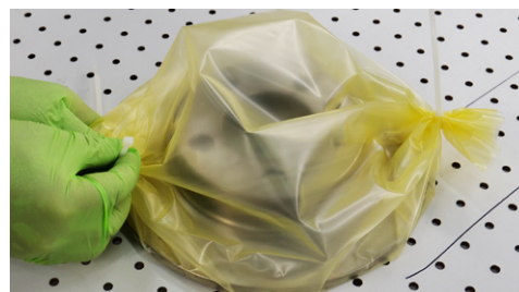
ICT®510-PCR30 VCI Tubing