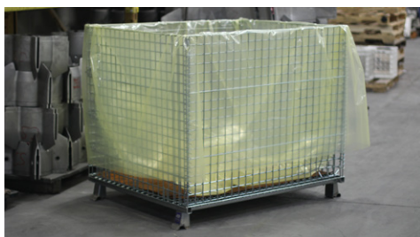
ICT®510-PCR30 VCI Gusset Liner