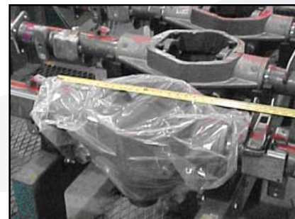
Zerust® ICT™520-CSL Film protecting a differential unit for service shipment. This unit is typically wrapped with VCI paper and sealed with tape.