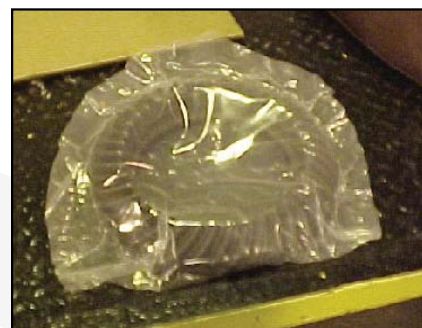
Zerust® ICT™520-CSL Film protecting a large gear for service shipment. This unit is typically wrapped with VCI paper and sealed with tape.