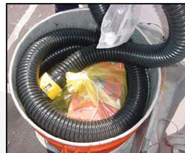
The simple incorporation of Zerust® ICT™510-C Ferrous Bags into the storage process of Bail-out Pump Motors proved to stop corrosion from forming.